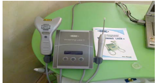
Figure (3): DMC whitening lase II bleaching device.

After thermocycling the apices of teeth were blocked with cold cure acrylic and the teeth were coated with two layers of nail varnish except 1mm around the gingival margin. The teeth were then immersed in buffered 2% methylene blue solution at 37\text{ }^{\circ}\text{C} for 24 hours, thoroughly rinsed with running water, then each tooth was longitudinally sectioned with a slow speed diamond sectioning disks (KG Sorensen SP, Brazil) in a buccolingual direction through the middle of the restoration, the sections were evaluated by two independent calibrated examiners on the stereomicroscope (Hamilton by A Italy international Italy) at a magnification level of x 40 to determine the extents of dye penetration on the gingival walls and the mean between two reading was depended. (9, 21) . (Figure 4).