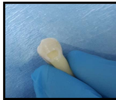
(Figure 1): class V cavity in the buccal surface of premolar.

The adhesive system G-permio bond (GC, Japan) was applied according to the manufacturer's instructions using a disposable applicator. The solvent was evaporated with a gentle air-blast for five seconds, and the adhesive was light-cured using a halogen light (Vivadent, Schaan, Liechtenstein) for 20 seconds with a standard light at 480 mW/cm 2 assessed with a radiometer every five restorations. Then the specimens were divided into two major groups; the control group (unbleached group; group I, III and V) and bleached group (group II, IV and VI) according to the restorative material ten cavities for each group.