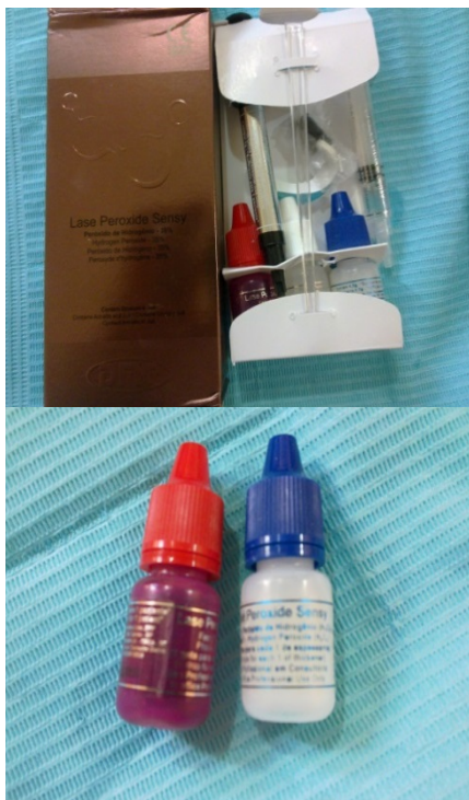
Figure (2): Bleaching material.

The application of DMC Laser was made according to the manufacturer instruction (apply radiation for 3minutes then rest (without radiation) for 2 minutes this procedure is repeated for three times, then the bleaching materials were washed with distilled water and air for 1 minute and apply new material and repeat the same procedure). After bleaching after one week, the specimens were subjected to 500 cycles of thermal baths at temperatures of 5\text{ }^{\circ}\text{C} \pm 2\text{ }^{\circ}\text{C} to 55\text{ }^{\circ}\text{C} \pm 2\text{ }^{\circ}\text{C} , with 30 seconds dwell time and a 3 seconds transfer (20) .